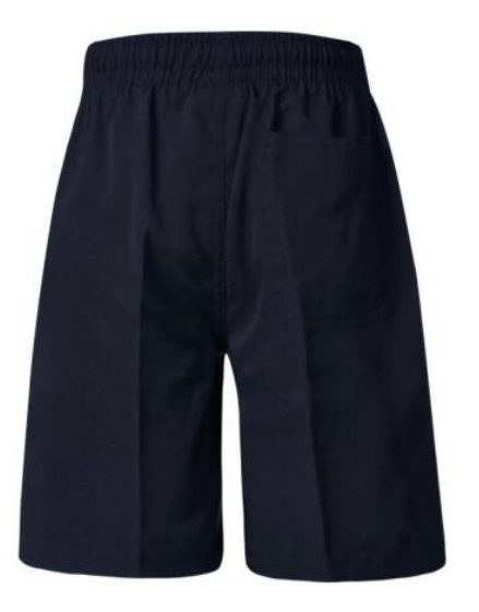
Boys Navy Shorts