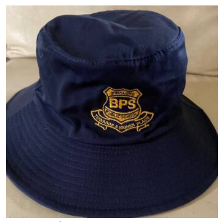
BPS Bucket Hat