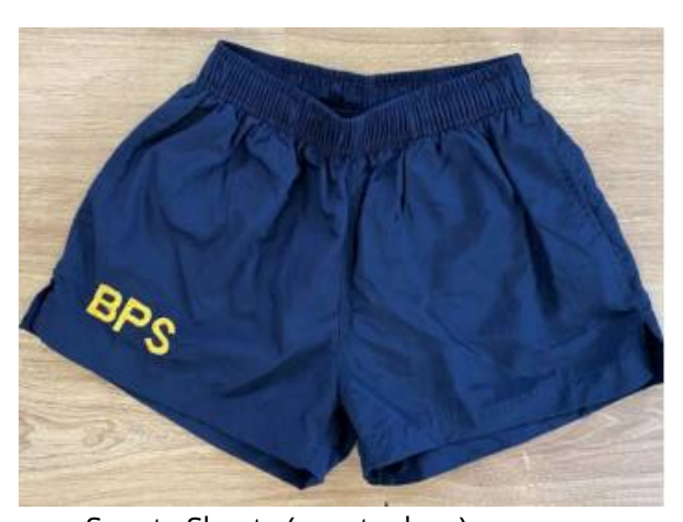
Sports Shorts (sports days)