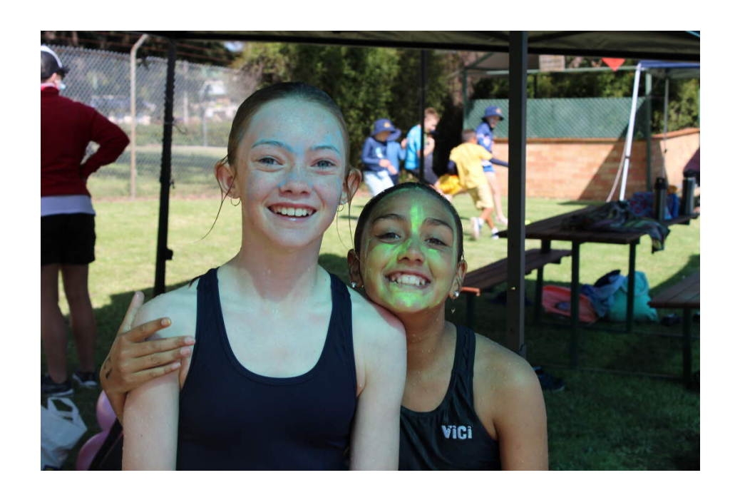
BPS Swimming Carnival