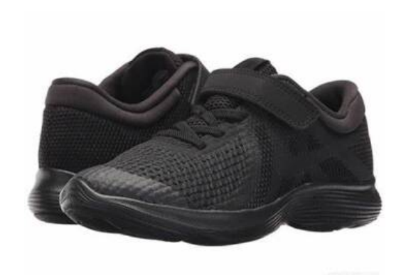
Example of Black Sneakers