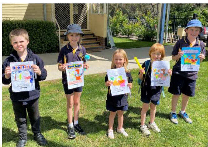
Book Fair colouring in competition winners

Thank you to all families and community members for your support in our Book Fair. A whopping $1600 was spent on purchases with some of this going towards the purchase of new books and resources for the school. Students helped choose the purchases of new books for the school library.